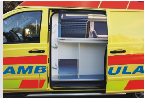
Locations of oxygen bottle and equipments