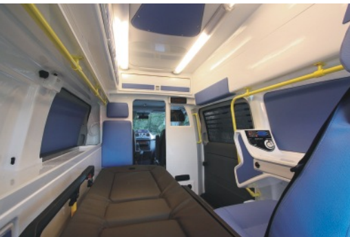
Comfortable work environment

Wheelbase: 3430 mm External height: 2315 mm ± load variation internal height: 1670 - 1715 mm internal width: 1630 mm internal length: 2530 mm