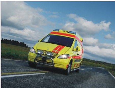
Integrated warning lights